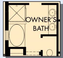
OPTIONAL SEPARATE SHOWER AND TUB AT OWNER'S BATH