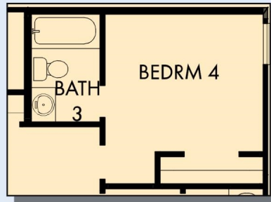
OPTIONAL BEDROOM 4 WITH BATH 3 AT RETREAT