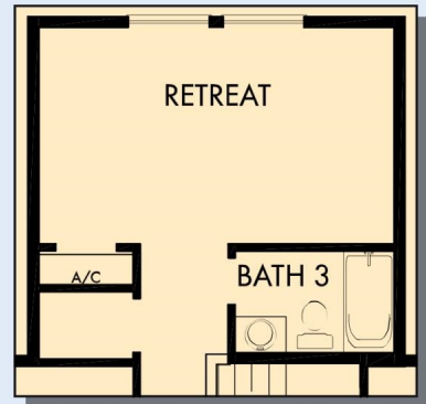
OPTIONAL BATH 3 AT RETREAT

For additional options, please visit DavidWeekleyHomes.com