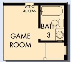
OPTIONAL BATH 3 AT GAMEROOM

For additional options, please visit DavidWeeklyHomes.com