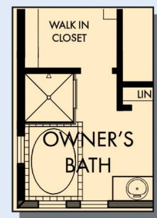
OPTIONAL SEPARATE TUB AND SHOWER AT OWNER'S BATH

For additional options, please visit DavidWeekleyHomes.com