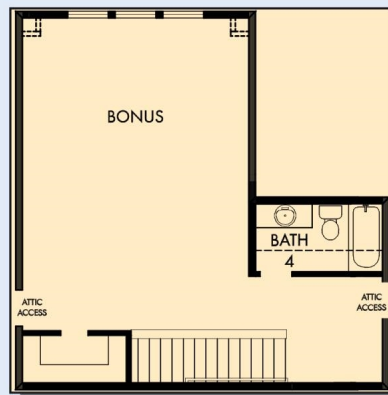
OPTIONAL SECOND FLOOR BONUS WITH BATH 4