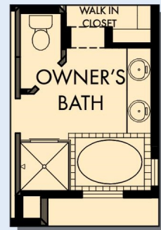
OPTIONAL DROP TUB AND SHOWER AT OWNER'S BATH