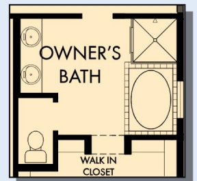
OPTIONAL DROP-IN TUB WITH SEPARATE SHOWER AT OWNER'S BATH