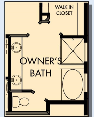
OPTIONAL SEPARATE TUB AND SHOWER AT OWNER'S BATH