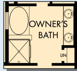
OPTIONAL SLIP-IN TUB WITH SEPARATE SHOWER AT OWNER'S BATH