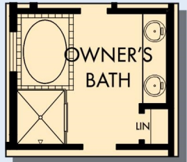
OPTIONAL DROP-IN TUB WITH SEPARATE SHOWER AT OWNER'S BATH