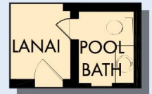
OPTIONAL POOL BATH AT LANAI