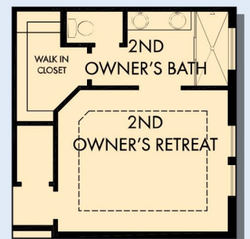
OPTIONAL 2ND OWNER'S RETREAT AT BEDROOMS 3 AND 4