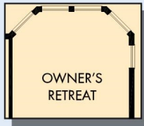
OPTIONAL BAY WINDOW AT OWNER'S RETREAT

2,731 - 2,749 sq. ft. • 4 Bedrooms • 3 Full Baths • 2 Car Garage