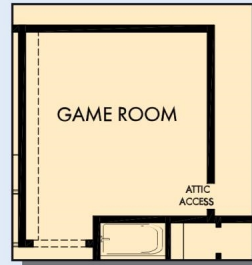
OPTIONAL GAME ROOM