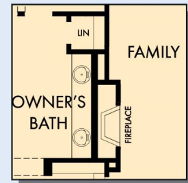
OPTIONAL WALL FIREPLACE AT FAMILY