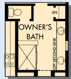
OPTIONAL STAND ALONE SHOWER AT OWNER'S BATH