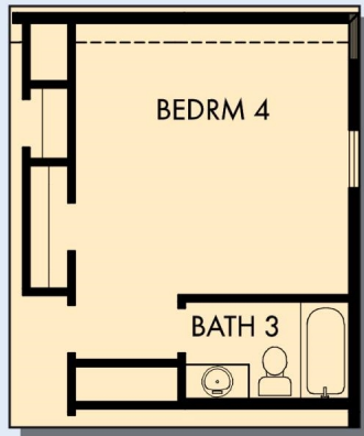
OPTIONAL BEDROOM 4 WITH BATH 3 AT GAMEROOM