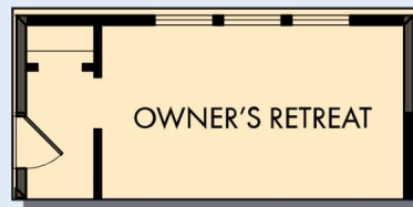
OPTIONAL EXTENDED OWNER'S RETREAT