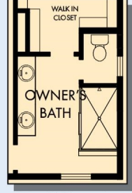
OPTIONAL SUPER SHOWER AT OWNER'S BATH (AVAILABLE WITH ELEVATION B ONLY)