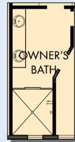
OPTIONAL SUPER SHOWER