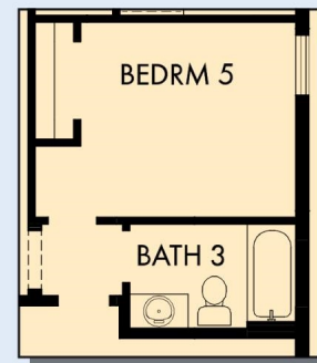
OPTIONAL BEDROOM 5 AND BATH 3 AT STUDY