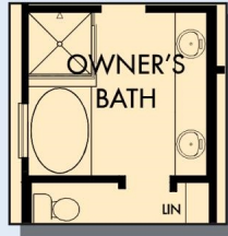
OPTIONAL SLID IN TUB WITH SEPARATE SHOWER AT OWNER'S BATH