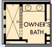
OPOTIONAL SUPER SHOWER AT OWNER'S BATH