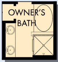
OPTIONAL SEPARATE TUB AND SHOWER AT OWNER'S BATH