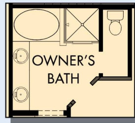
OPTIONAL SLIP IN TUB WITH SEPARATE SHOWER AT OWNER'S BATH