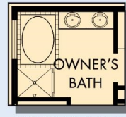
OPTIONAL DROP IN TUB AND SEPARATE SHOWER AT OWNER'S BATH