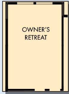
OPTIONAL EXTENDED OWNER'S RETREAT

2,433 - 2,553 sq. ft. • 4 Bedrooms • 3 Full Baths • 2 - 3 Car Garage