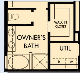
OPTIONAL SEPARATE TUB AND SHOWER AT OWNER'S BATH