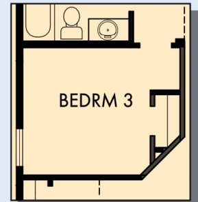
OPTIONAL BEDROOM 3 AT STUDY